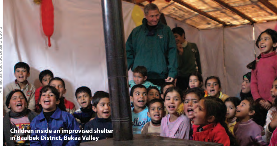
Children inside an improvised shelter in Baalbek District, Bekaa Valley

is becoming more normalised. There is currently an enormous gap in understanding whether and how CTs either prevent or address under-nutrition (wasting, stunting and micronutrient deficiencies) in humanitarian contexts.