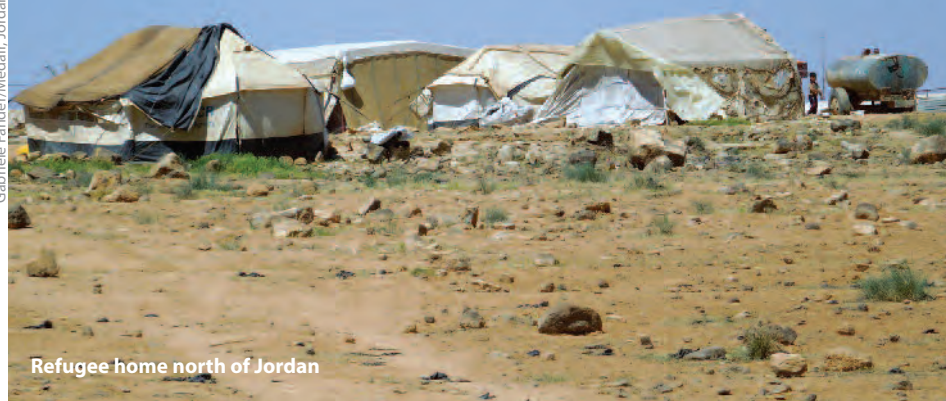
Refugee home north of Jordan

up treatment programmes in Lebanon (such as described by International Orthodox Christian Charities (IOCC) 11 and Relief International 12 ) and in Jordan (such as implemented by Medair 13 , Jordan Health Aid Society (JHAS) 14 and Save the Children Jordan 15 ). As neither country had prior experience of implementing treatment programmes, considerable investment was made in building national capacity 16 and in training initiatives 17 . These experiences are featured in a number of interesting articles, many that worked to integrate acute malnutrition treatment in the healthcare systems in Jordan and Lebanon. A similar scale up has not been seen in the Turkey Government led response.